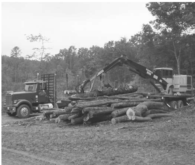
The log deck is where trees are processed and loaded onto a trailer. This area can make for an excellent wildlife opening at the conclusion of the harvesting operation.