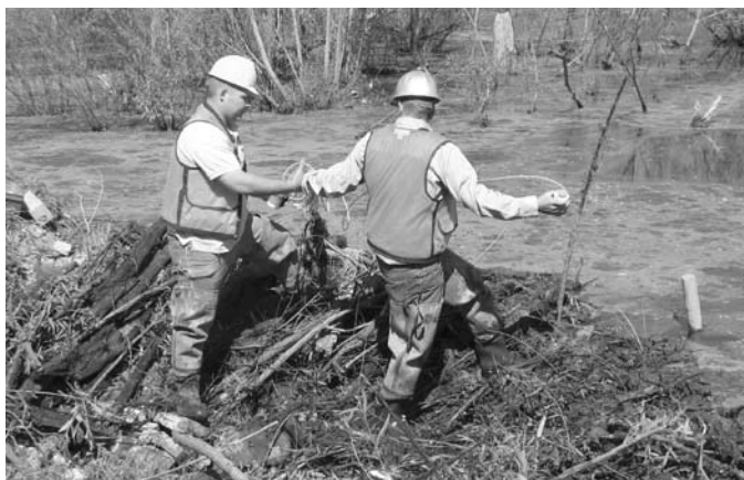
BMAP staff prepare to demolish a beaver dam.

Each year a BMAP leaflet listing telephone contacts, by county, is distributed to all interested parties. Requests for technical assistance, educational programs, and similar activities are given high priority and are provided at no cost to cooperators and the general public. ❖