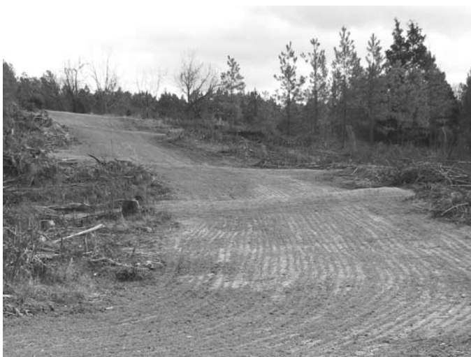
This skid trail was seeded and will serve as a fire lane and access road on the property. Landowners can encourage wildlife such as deer and turkeys by planting clover.