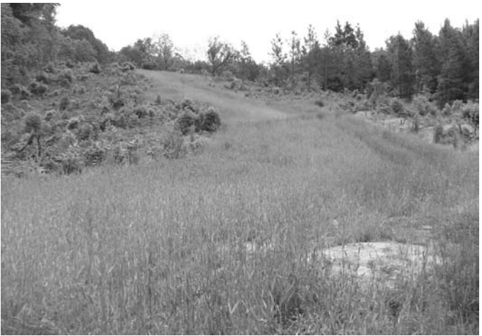
Here is the same skid trail a year later.