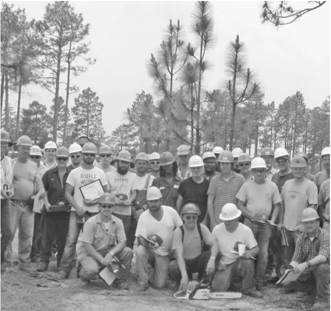
NCFE ProLoggers pose for a photo after completing three days of training on safety and environmental requirements.

The FPGs are rules that protect water quality from a variety of potential pollution sources, including sediment. Compliance with the FPGs is mandatory on forestry sites and there may be other state or federal rules that also must be followed in addition to the FPGs. The North Carolina Division of Forest Resources is charged with technical oversight and compliance monitoring.