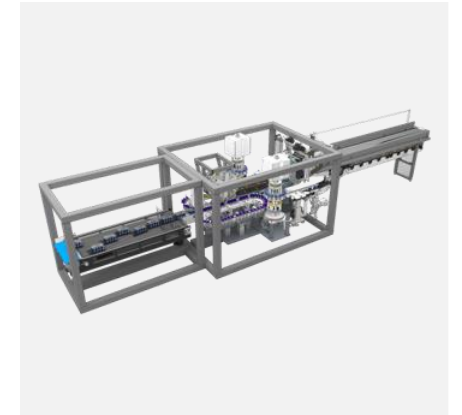
Paper & Board