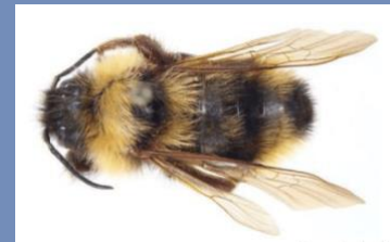
Suckley bumble bee