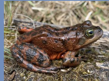
Oregon Spotted Frog