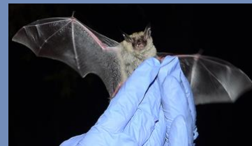
Northern Long-eared Bat