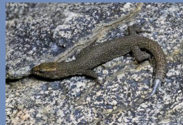
Sierra Night Lizard