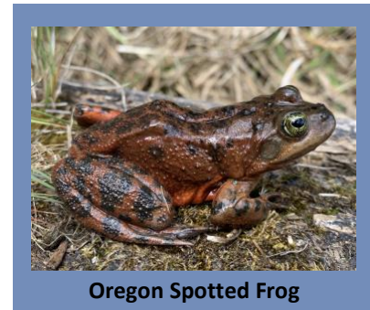
Oregon Spotted Frog