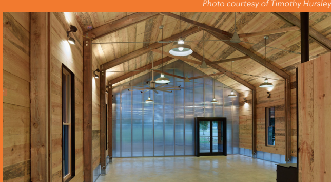
Part of Auburn University's Rural Studio design-build program, the Lions Park Boy Scout Hut was built using wood products certified to SFI as part of an SFI Community Grant, resulting from an Alabama SIC (SFI Implementation Committee) partnership.

have a shared mission to help kids grow up to be environmental leaders. For example, the new permanent site for the National Jamboree, the Summit Bechtel Reserve in West Virginia, includes about 12,000 acres of forest certified to SFI. Another 90,000 acres at a Scouts' high adventure base in New Mexico is also certified to SFI.