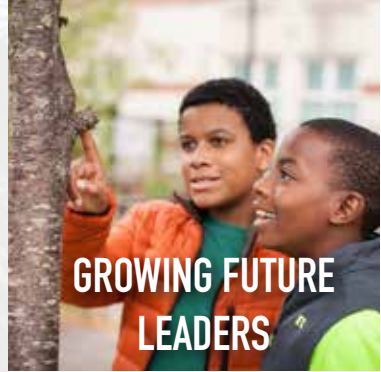
GROWING FUTURE LEADERS