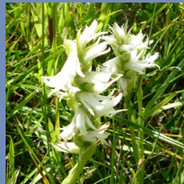
Ute Ladies' Tresses

All management recommendations assume that operators and land managers are following all applicable BMPs, laws, and regulations.