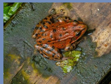
California Reg-legged Frog