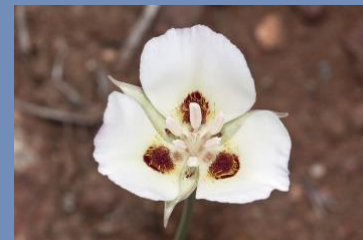
Dunn's Mariposa Lily