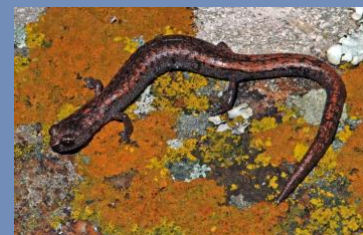
Tehachapi Slender Salamander

All management recommendations assume that operators and land managers are following all applicable BMPs, laws, and regulations.