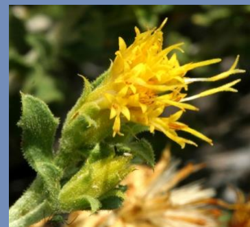
Winward's Whitestem Goldenbush

All management recommendations assume that operators and land managers are following all applicable BMPs, laws, and regulations.